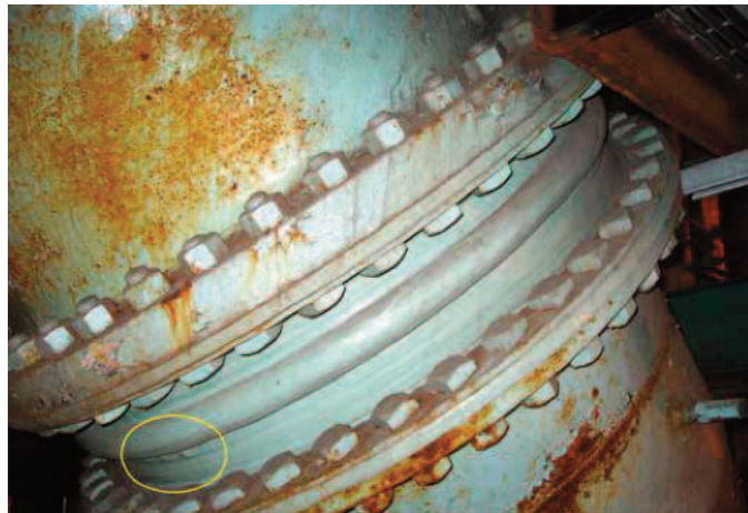
Inspection of REJ body blister as a failure mode

However, the characteristics of rubber lead to degradation over time, which is accelerated by stress and temperature. These conditions are common in power and process systems. Unchecked degradation can lead to a catastrophic failure that could cause a plant shutdown. However, rigid piping systems designed without REJs or a means for handling the thermal growth and other external movements can lead to the same catastrophic consequences despite inspection or maintenance frequency.